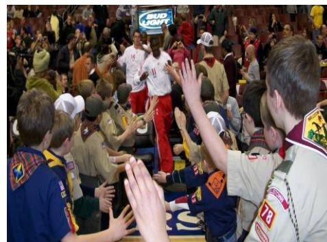
Scouts Greet the Sixers